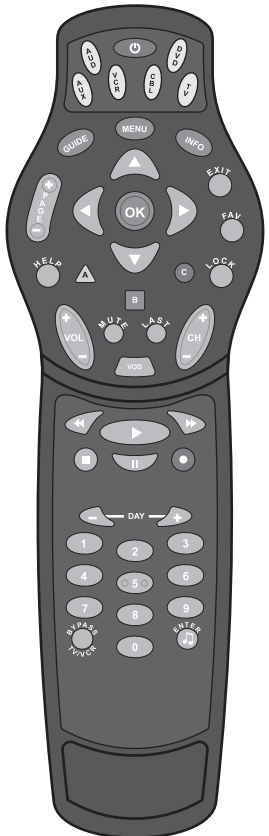
© 2003 US Electronics, LLC All rights reserved Part Number USE 18269, version 1.0 05202003

VISIT US ON THE WEB YOU CAN FIND PROGRAMMING INSTRUCTIONS AND CODES FOR ALL OF OUR REMOTE CONTROLS, AS WELL AS INFORMATION ABOUT OUR OTHER PRODUCTS ON OUR WEBSITE: www.uselectronics.com